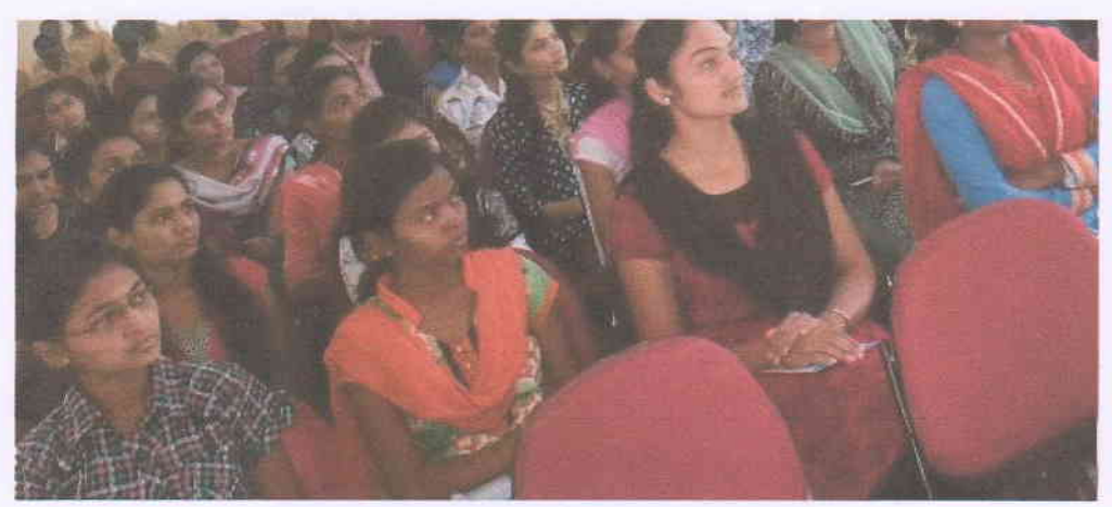
Session on Diet and Personal Hygiene